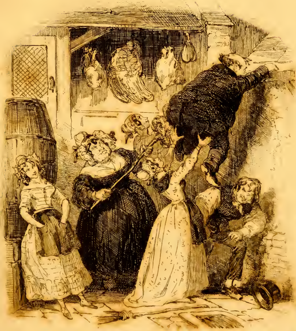
Scene of the Murder of Daniel

ILLUSTRATIONS FROM ORIGINAL DRAWINGS BY PHIZ.